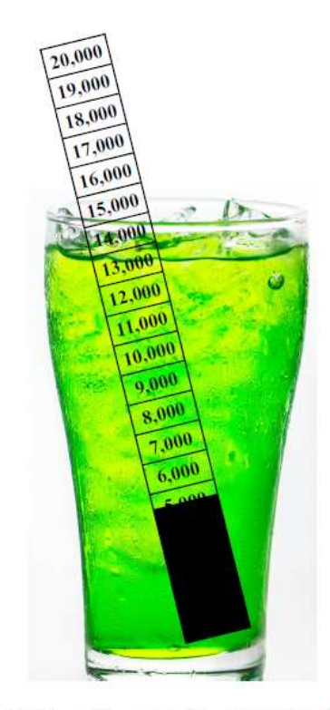
$5,530.00 has been collected for the Cool-Aid Campaign.