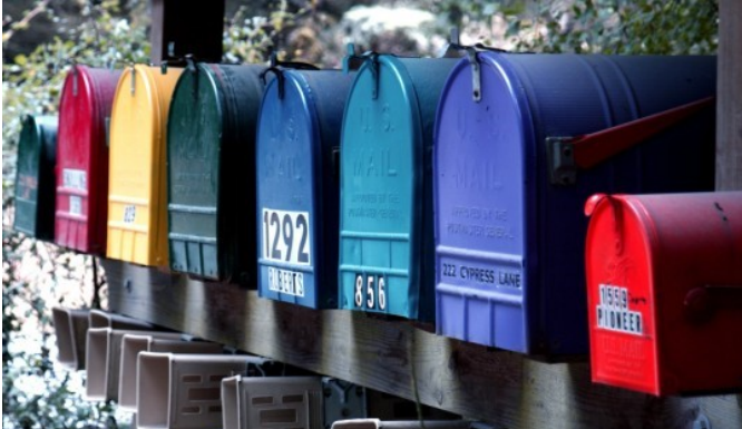
We've Got Mail